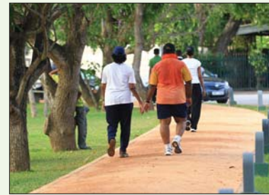
Walking track for all roads